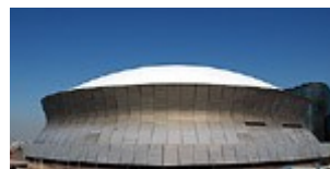
1 Superdome holds 4.4 million cu. yds. of borrow